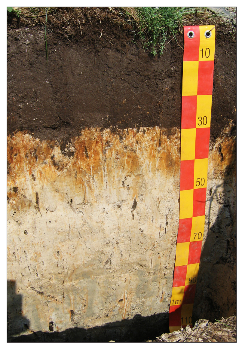
Figure 2. Morphological characteristics of dehydrated limnic carbonate sediments exposed in the soil profile

bonate sediments are often filled with organogenic material over sediments, which are subject to eluviation, illuviation, and vertilization [Piaścik, Gotkiewicz 2004, Kechavarzi et al. 2010].